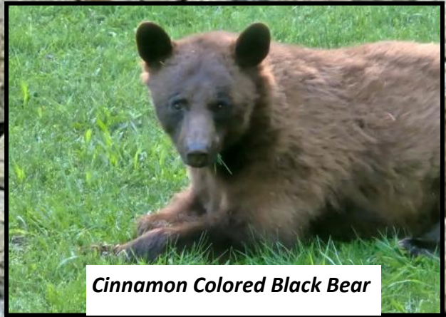
Cinnamon Colored Black Bear