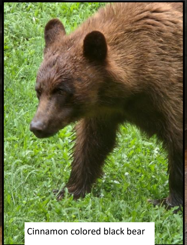
Cinnamon colored black bear